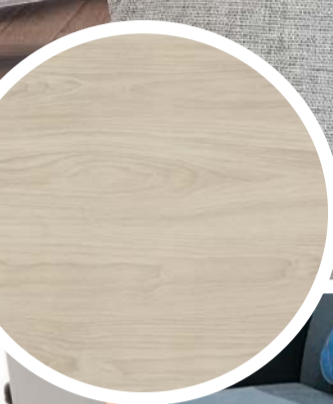
Shown here: 2 panel Cape Elm / Denim with Titanium frame

Tones of grey provide the perfect base for adding blue accents without being too overpowering.