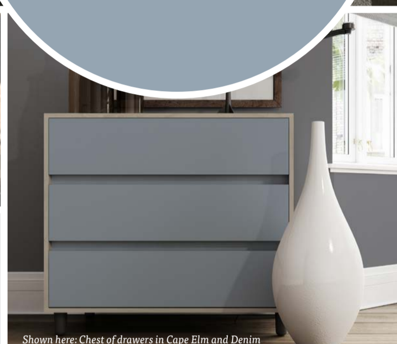
Shown here: Chest of drawers in Cape Elm and Denim