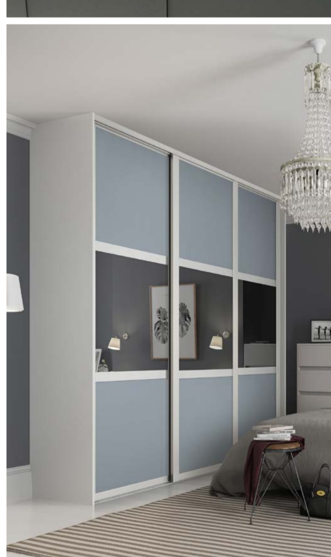
Shown here: 3 panel Denim / Mirror with Cashmere frame (matching end panel)