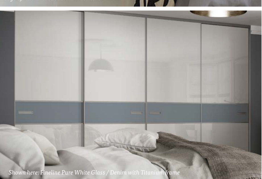
Shown here: Finline Pure White Glass / Denim with Titanium frame