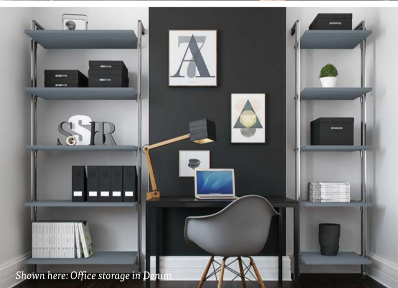
Shown here: Office storage in Denim