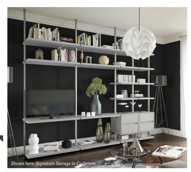
Cashmere interiors look stunning against charcoal walls.